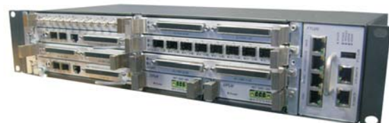
VCL-1400 - 7 Slot