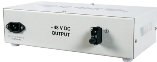
VCL-AC to DC Converter

This is an external converter power supply, which is available in a portable desktop version with one fused - 48 V DC output.